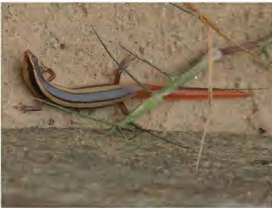
Fig. 2I. Common Keeled Skink Eutropis carinata .